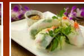
Fresh Basil Rolls