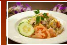
Thai Fried Rice