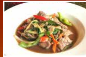
Queen of Siam Basil