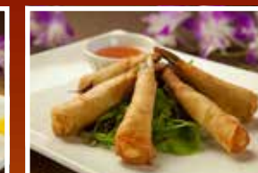
Shrimp In The Blanket