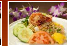
Shrimp Fried Rice