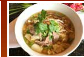
Beef Noodle soup