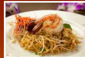
Shrimp Pad Thai